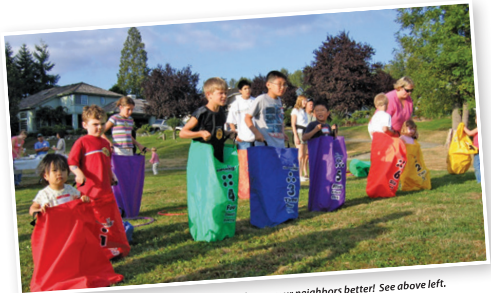
Neighborhood Picnics are a great way to get to know your neighbors better! See above left.

Visit rentonwa.gov/outstanding for a nomination form or call Renton Chamber of Commerce for more information at 425-226-4560.