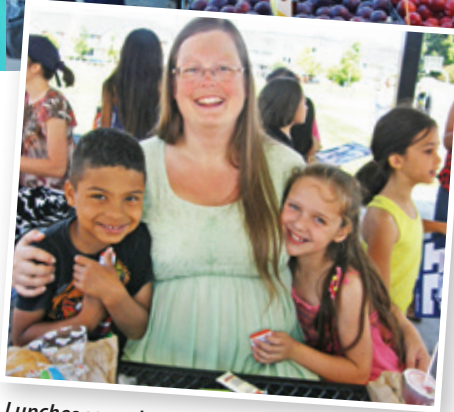
Lunches served at several locations.

The 2015 Neighborhood Picnic schedule is available at rentonwa.gov/picnics , or contact Norma McQuiller at nmcquiller@rentonwa.gov or 425-430-6595.